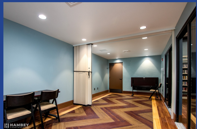
Small Meeting Rooms