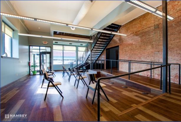
Large Meeting Room