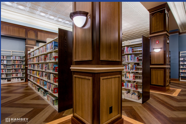
Adult Fiction Shelving